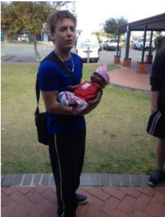
The Baby Think it Over Program

There were also many incursions supporting the protective behaviour framework. These ranged from hard hitting real life stories and lessons relating to education around alcohol, drugs, driving and sound decision making but also included nutritional literacy which educated students about healthy nutrition as well as giving them the chance to actually plan and cook healthy meals. Curtin University also provided in house science courses. The Baby Think it Over program was also a resounding success. This is the program where students adopt an electronic baby for a week and have to attend to its needs 24 hours a day providing students with actual experience of parenting a baby and empowering them to make more informed decisions.