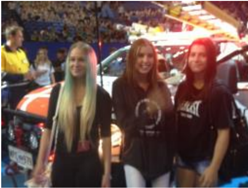
Some Comet students at the RAC Streetwise conference.

There were also many incursions supporting the protective behaviour framework. These ranged from hard hitting real life stories and lessons relating to education around alcohol, drugs, driving and sound decision making but also included nutritional literacy which educated students about healthy nutrition as well as giving them the chance to actually plan and cook healthy meals. Curtin University also provided in house science courses. The Baby Think it Over program was also a resounding success. This is the program where students adopt an electronic baby for a week and have to attend to its needs 24 hours a day providing students with actual experience of parenting a baby and empowering them to make more informed decisions.